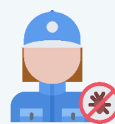
Pest Control Technician