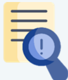
Attention to detail