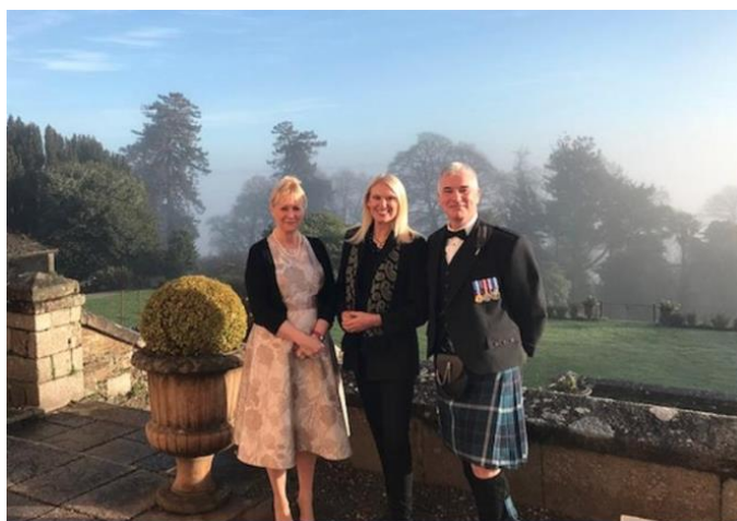
At the official launch of Operation Encompass across the Devon and Cornwall force Anneka Rice was announced as Patron of the Charity.